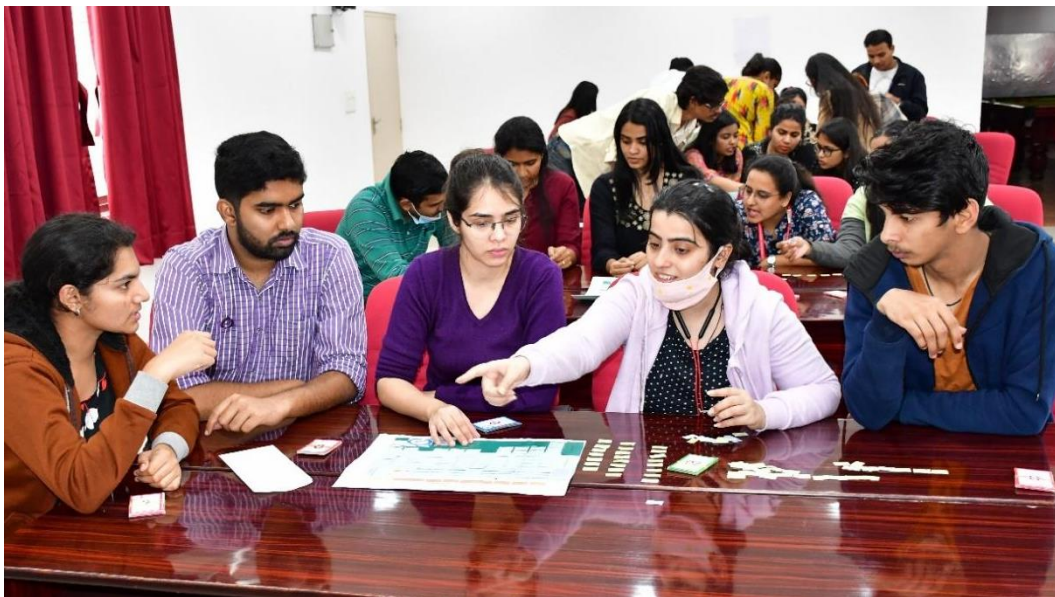
Product Backlog Activity

In the research methodology course, after some initial chapters which provide fundamental understanding of research had been covered, student groups were asked to choose a broader research problem. While each set of steps of the research process was taught in the class, the student groups were supposed to work, in parallel, on their research problem corresponding to the steps covered in the class and make submissions. This exercise was to culminate in a research paper.