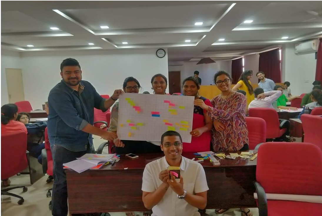
Role play on mind mapping