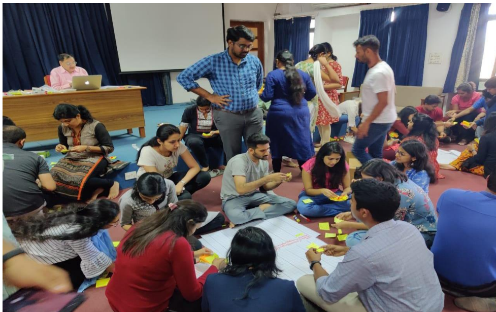
Role play Mind Mapping Activity