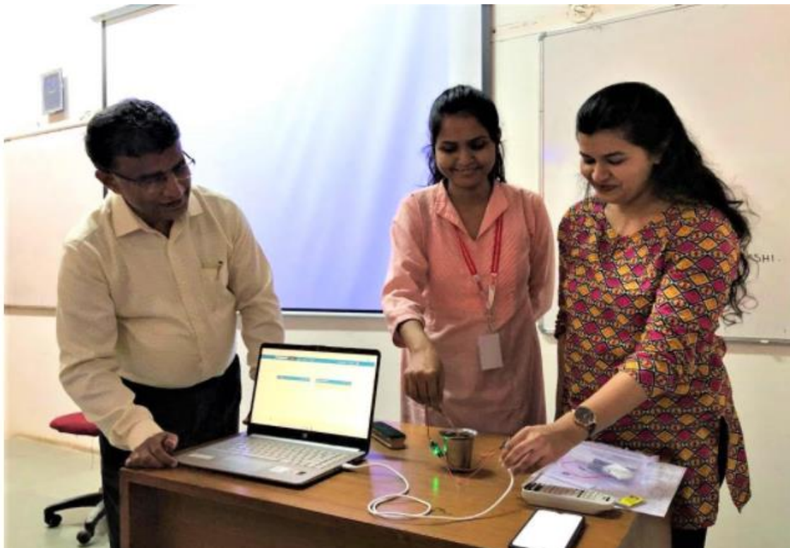
Live IoT demonstration

a microcontroller board could sense the moisture data every 20 seconds and how the data to the cloud could be uploaded database using Wi-Fi communication network. Students also witnessed how ThingSpeak – an open IOT platform software - was able to read this sensor data in real time and provide a plot of analytics data. Students were also able to download the sensor data into excel file for further analysis. This kind of approach was found to enthuse students to think of multiple opportunities to ideate solutions to business problems for example, in the irrigation and agriculture space.