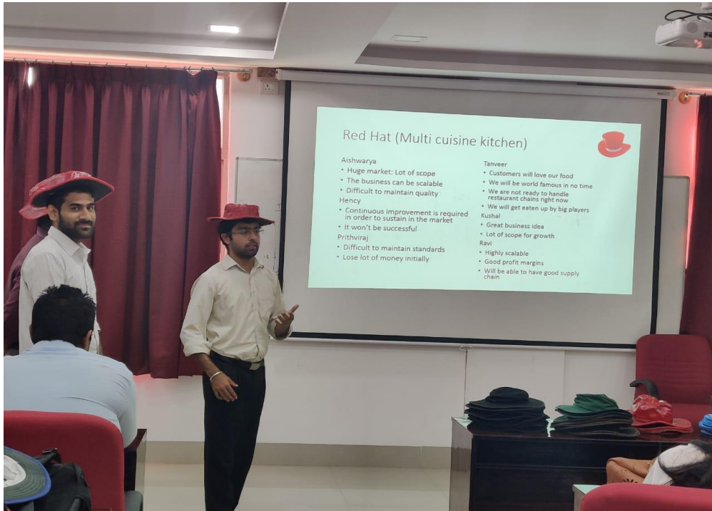
Role play six thinking Hats

classes after they had searched out appropriate videos and case facts from various sources.