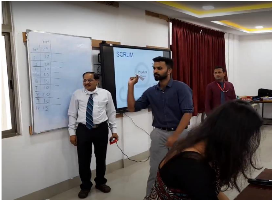
Paper Aeroplane Game