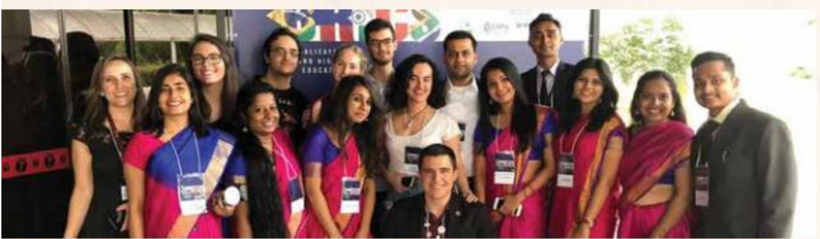
10th BRICS meet hosted by PUCPR University, Curitiba, Brazil from 12 – 15 November 2018.

XIME students regularly participate in the annual convention of the ABBS held in one of the BRICS countries.