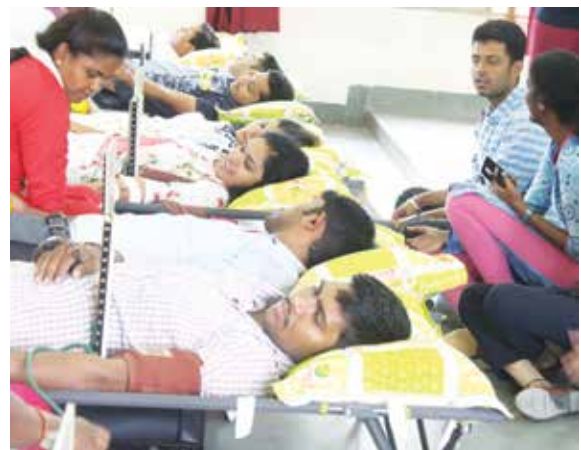
Students of XIME donating blood

The social service club of XIME, X-Seed, conducted a blood donation camp in the college premises on 7 th September 2017 in collaboration with the Kidwai Memorial Institute of Oncology. Students of XIME and employees of corporates in Electronic city volunteered as donors, and the response was encouraging, with a total of 120 units of blood being donated, which would help at least 400 children for blood transfusion! A few were first time donors, and the satisfaction that they got by donating was immense as it not only helps these children but also benefits the donor by improving his/her health.