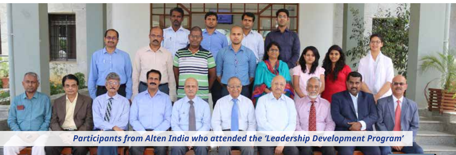
Participants from Alten India who attended the 'Leadership Development Program'