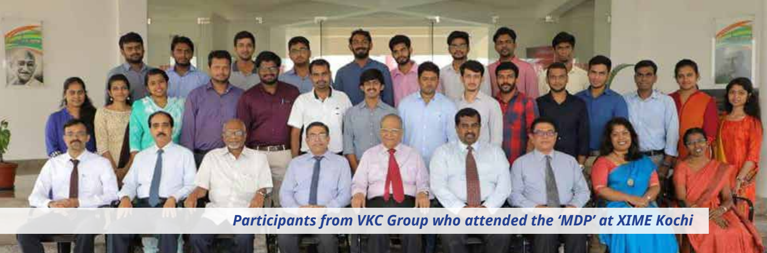
Participants from VKC Group who attended the 'MDP' at XIME Kochi

The participants gave a good feedback for the program and according to them learning SPSS, how to remove bottlenecks, managing conflicts, goal setting, budgeting, analytical skills for the concept of business research, design thinking etc. were some of the specific skills that they could take away from this program. It is proposed that we have a follow up program after 6 months.