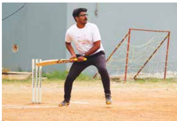
Students of batch 22 & 23 competed against each other

Ximeans received their first sports offering of the new academic year in the form of Xavier's Cricket League. The event was conducted from 11 th - 17 th July 2017. All the matches were closely contested, and had a great support from students, who came in large numbers to support their sections and that added to the excitement. Team 22C emerged as winners in the final, which was held amidst much fanfare on the 17 th July 2017.