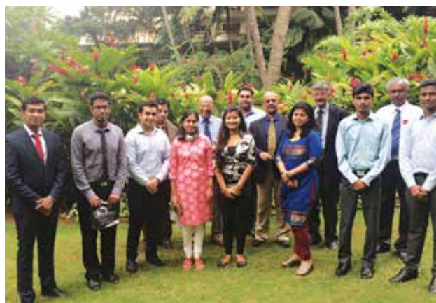
President's club at The Oberoi