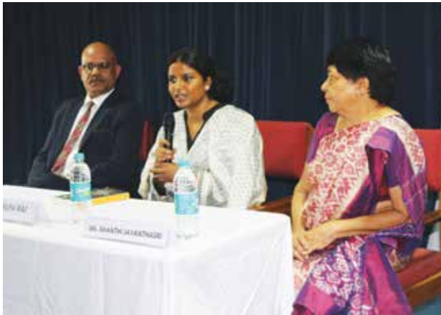
Launch of the book "The Elephant Chaser's Daughter"