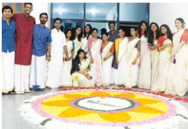
Students dressed up in the traditional attire

Onam, the harvest festival of Kerala, was celebrated with much elan and enthusiasm on the 9 th September 2017. The elaborately laid flower carpet and sights of people adorned predominantly in white and gold, displayed the culmination of students across cultures dressed in the traditional attire of Kerala to celebrate Onam.