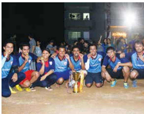
Team Carnifex (22C) after winning the trophy

MarkXime also conducted a marketing competition for Batch 23. The students had to market their respective teams in the most creative ways possible within a limited budget. This set the ball rolling both on and off the field. The different sections of Batch 23 indulged in activities like creating handmade posters, conducting fun games for the audience, a golgappa eating challenge and also sponsoring a First-Aid kit for the entire tournament. The best Marketing Team prize was awarded to Section D of Batch 23, Team Dracarys.