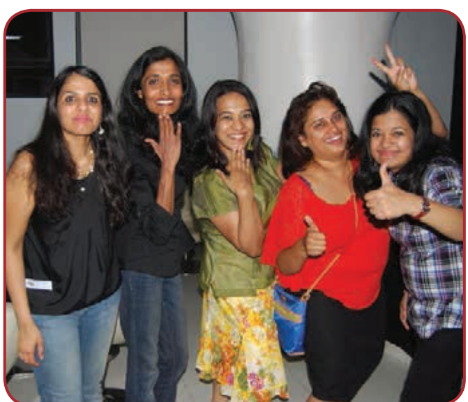
Alumni Open House