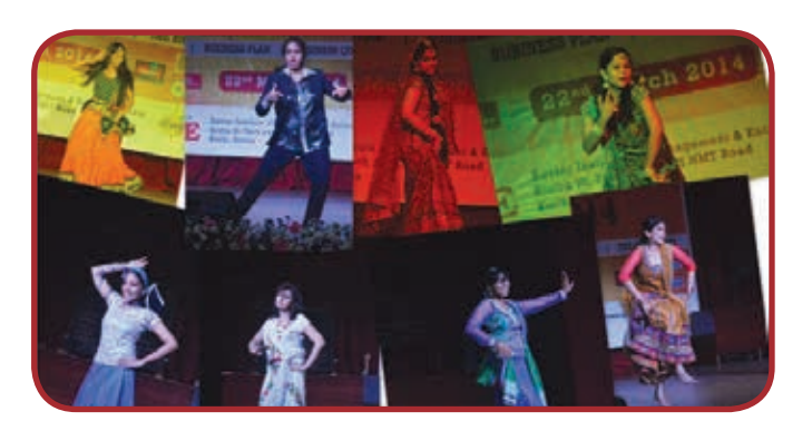
A dazzling display of talent by our students.