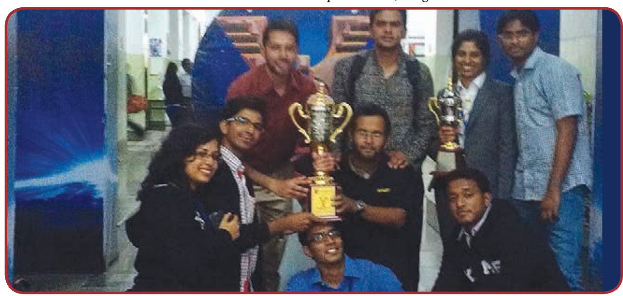
XIME\ Team\ -\ Overall\ Champions\ at\ TSM\ Madurai