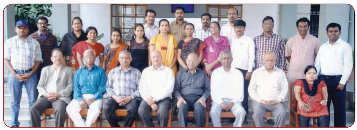
Participants of MDP-'Enhancing Effectiveness of Voluntary Organizations'

An MDP titled 'Enhancing Effectiveness of Voluntary Organizations' was conducted from the 16<sup>th</sup> - 18<sup>th</sup> of January 2014. This MDP focused on key areas like building a credible NGO Leadership, People management in an NGO, sustainable business models for NGOs funds raising and budgetary control. The program was addressed to the senior and middle level managers, staff of voluntary organizations/ NGOs and Faculty associated with teaching and research in this area. This MDP saw 18 participants from various NGOs who actively participated and made it a grand success.