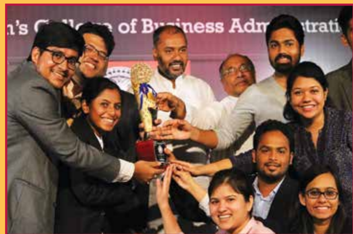
Winners of "Verve"