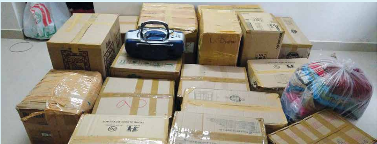
Bundles of clothes collected for distribution to the needy

Social Responsibility is built into the students of XIME Kochi through the activities of the social club, XSEED. There was an overwhelming response from the students of XIME Kochi in contributing around 210 kgs of clothes to Goonj, an NGO which provides the unaddressed need of the basic need of clothing to the deserved. Helping the needy is always in the blood of XIMEANS!!!