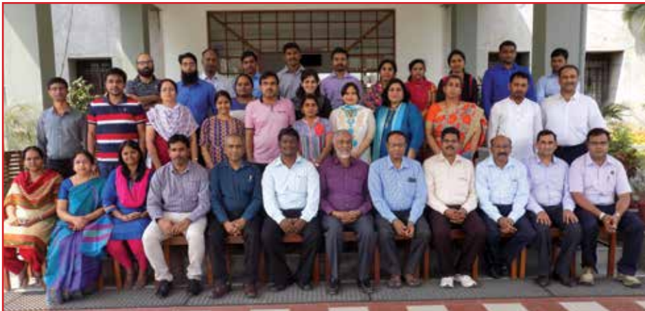
Participants at Workshop on Applied Econometrics for Business and Finance