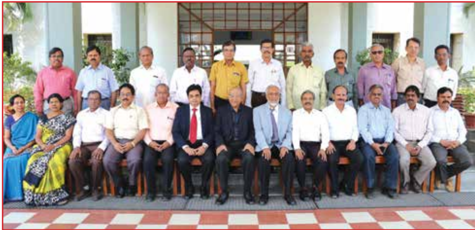
Participants with key Resource Persons at Leadership development Programme