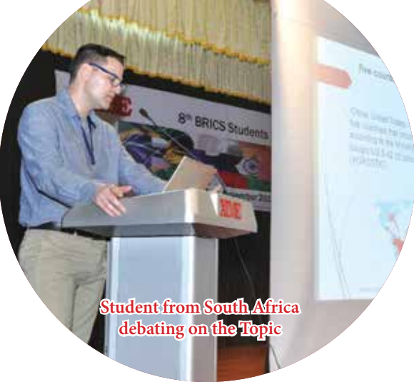
Student from South Africa debating on the Topic

of the BRICS nations. The event provided a platform for Ximeans and students of participating colleges to show case