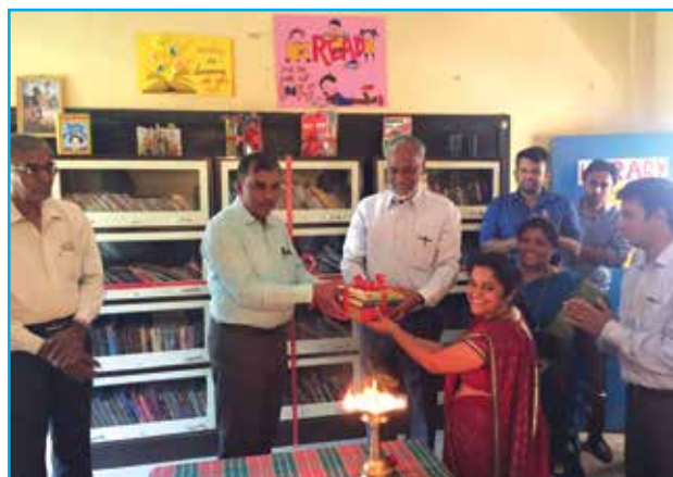
Lighting of Lamp by the dignitaries at Library Donation function