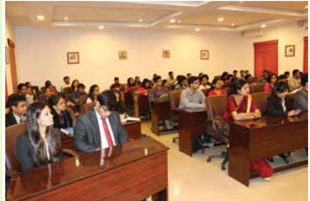
Paper presentations during the National Conference