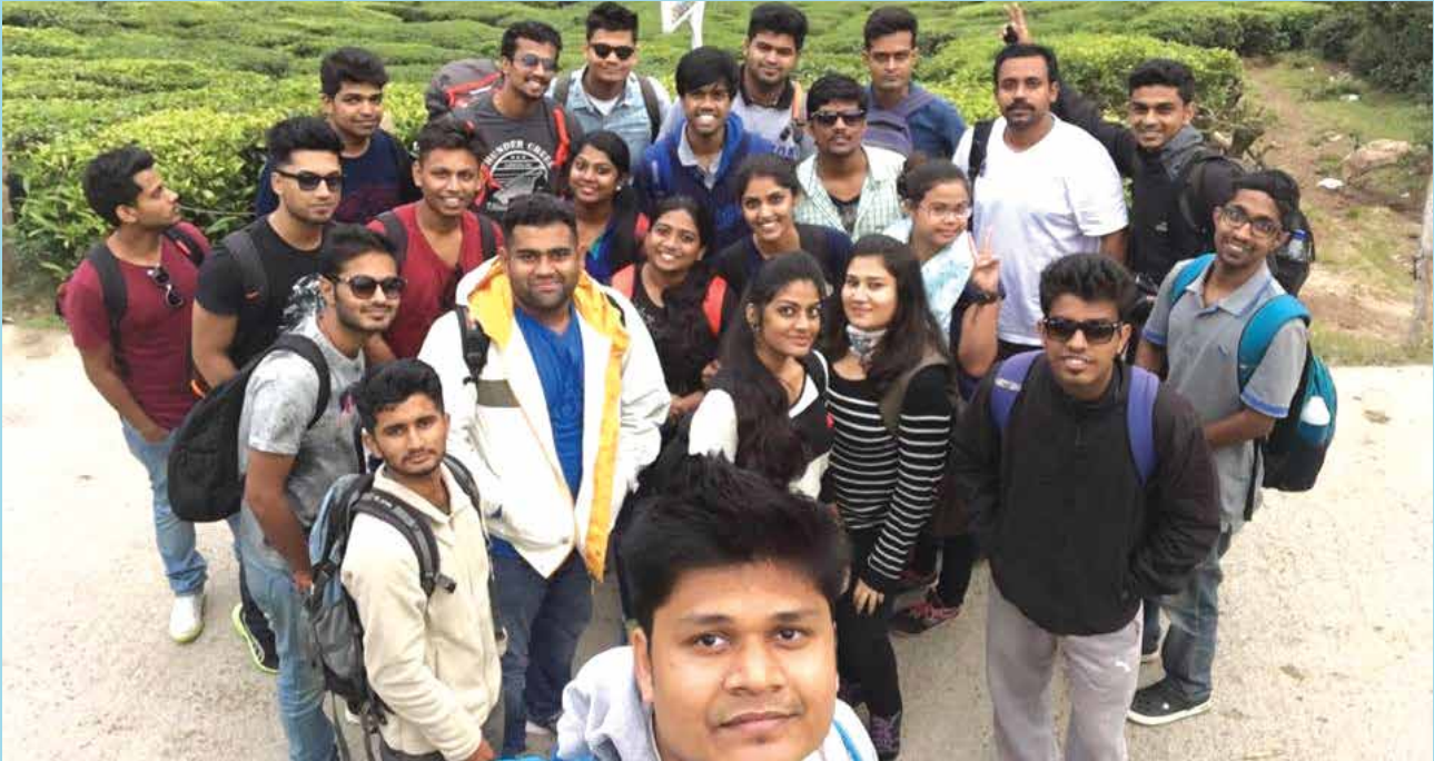
Members of Adventure Club - XIME Kochi on an outing

The newbie club in town - Adventure Club took their first adventurous activity with camping and trekking to Munnar - the beautiful hill station situated at the gorgeous Western Ghats and enjoyed the scenic beauty, forestry, tea plantations, scintillating night sky & wildlife.