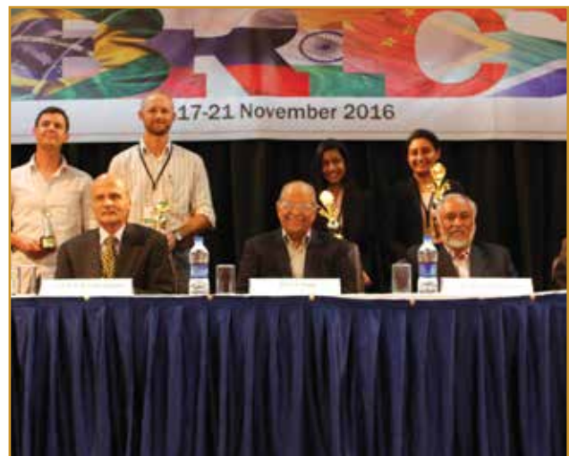
Winners of Debate competition with Luminaries of XIME