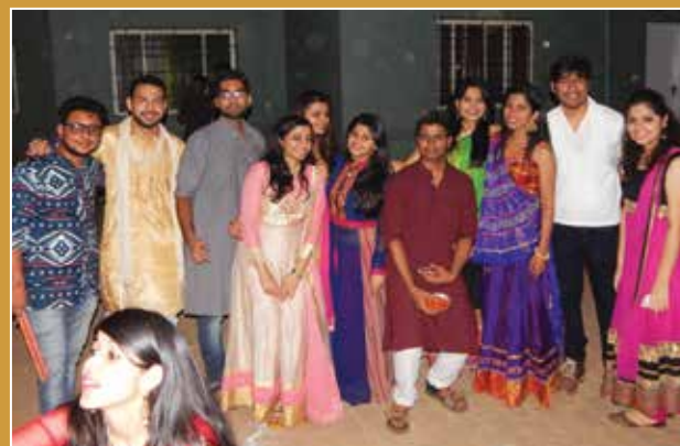
Rotaractors on Dhandiya Night

On 7th October, XIME in association with Rotaract Club organized a Dhandiya Night. XIME campus looked colorful with all the students dressed up in Gujarati style carrying their Dhandiya sticks. The money collected from the event was donated to SWANTHANA- an NGO for disabled female children.