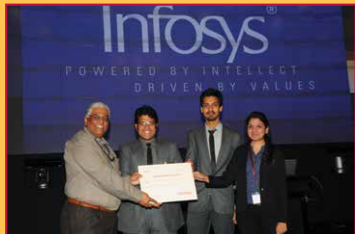
Winners of "Infosys Ingenious"