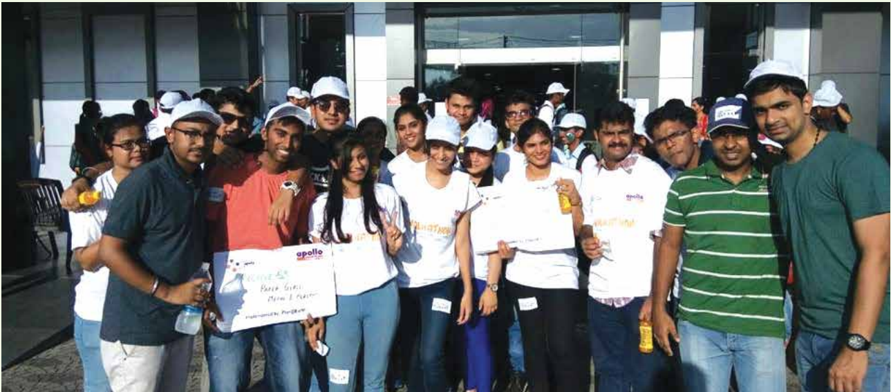
Enthusiastic participants on Walkathon Event

Working towards a social cause is always in the blood of XIMEANS. The very resilient XIMEANS in Clean Kalamassery campaign Walkathon in collaboration with Apollo Tyres Ltd. and Planatearth, Aluva on 04th Oct 2016.