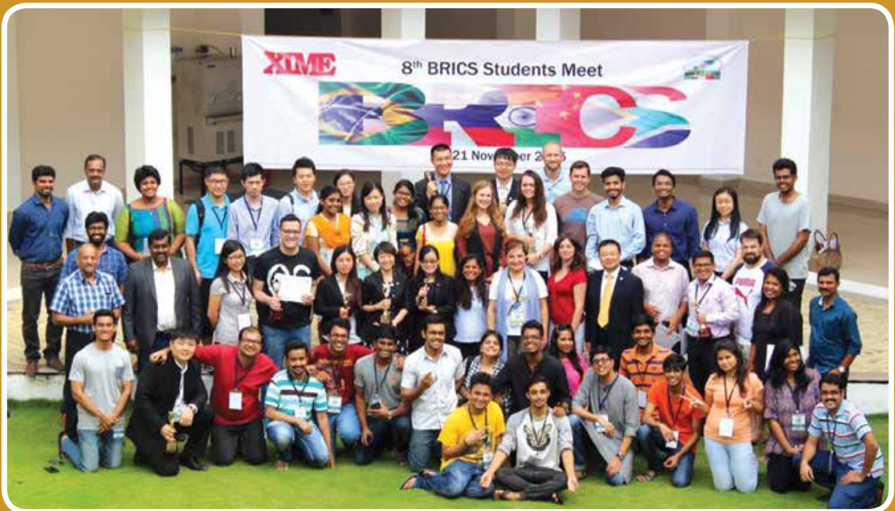
Participating teams @ XIME Kochi

As part of the 8th BRICS Students Meet the participating teams visited XIME Kochi on 19th November 2016. The meet started off with an amazing cultural night, which showcased the talents of students from all the BRICS nations. On second day, the students participated in various team events like Collage, Business Game, Photography and Best Manager. The events witnessed a true blending of cultures of various countries.