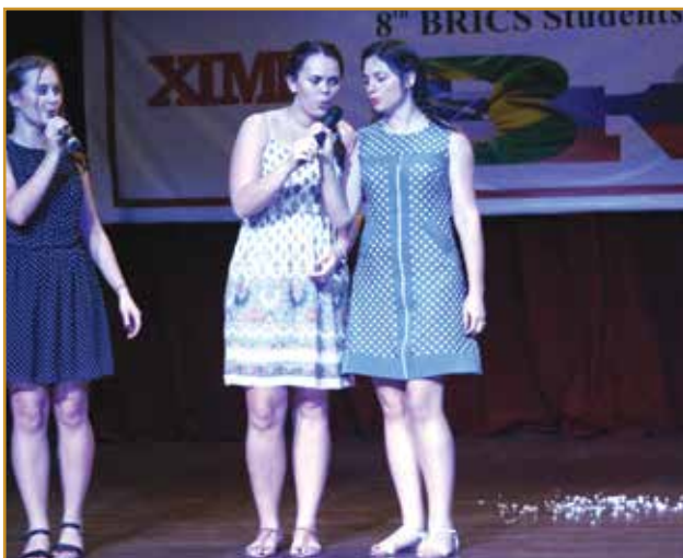
Participants at Team Event