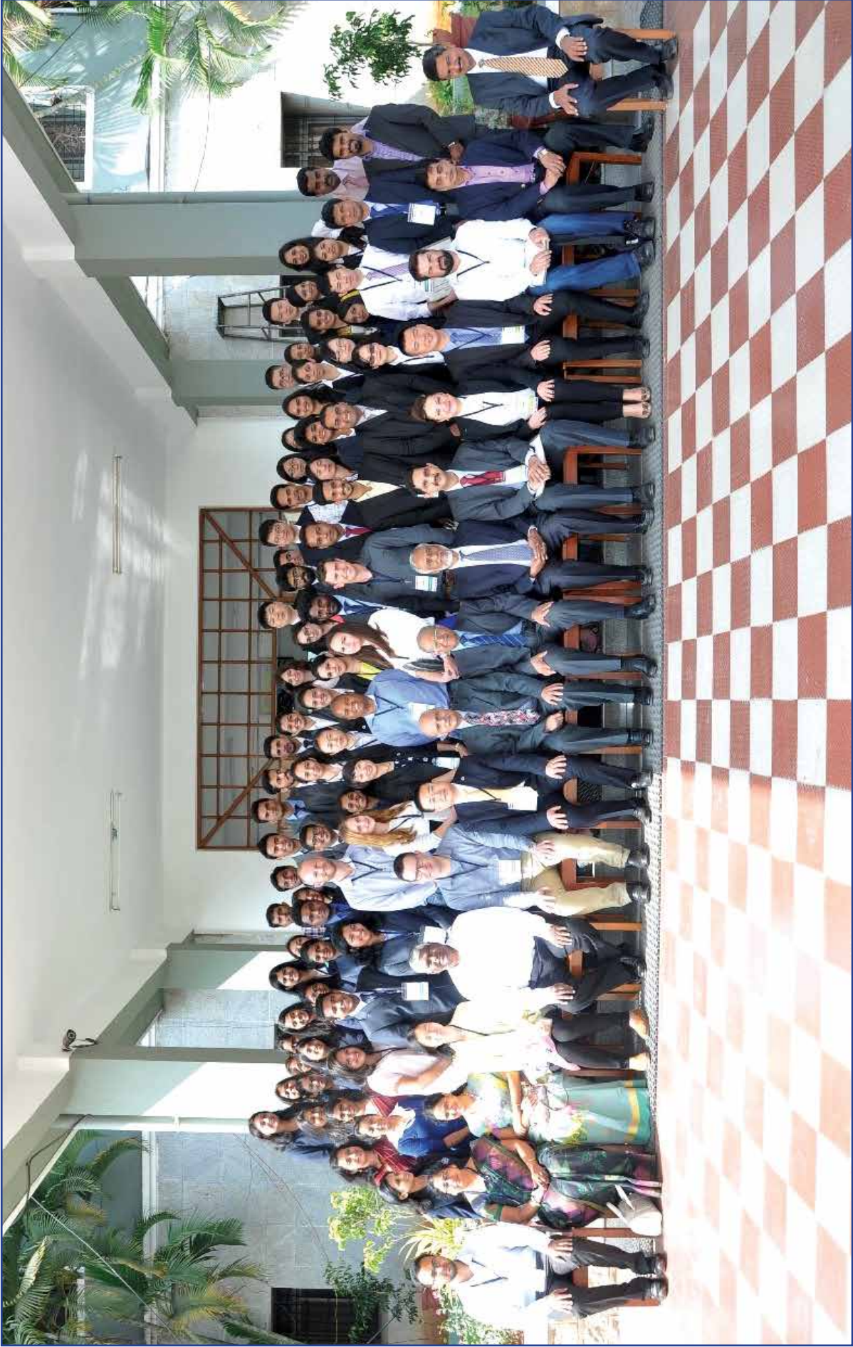
President - ABBS, invitees and Participating Teams at BRICS Students Meet