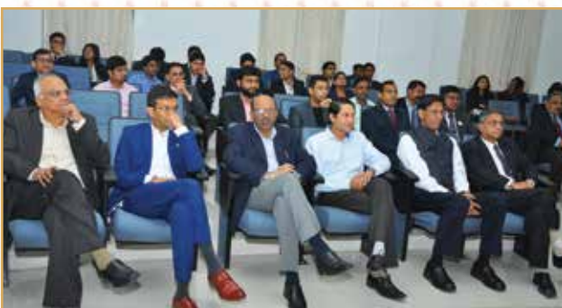
Distinguished Gathering at 10 th Anniversary of ISME