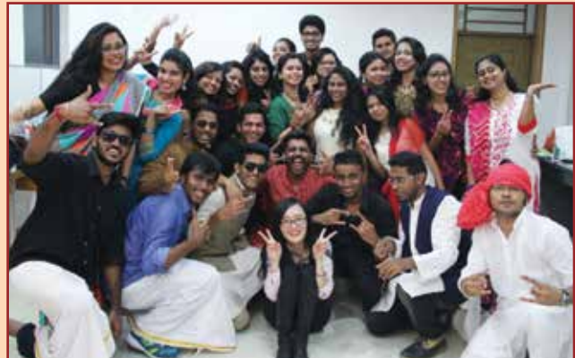
XIME students at Guangdong University, China

Thirty-one students of XIME completed their winter study program at GDUF, China in December 2016. The program included lectures on China's Economic Situation: From Growth to Development, Chinese Enterprises and Going Global Strategy, Chinese Leadership and Innovation, IChing- the Philosophical Foundation of Chinese Culture. The students had the opportunity to visit China Ceramics city, Guangzhou KEDA Industrial CO. LTD and Guangzhou Pearl River Brewery Group CO. LTD. The students actively participated in the cultural show with a fun filled song and dance performance. The tour exposed the students to Chinese culture and cuisines.