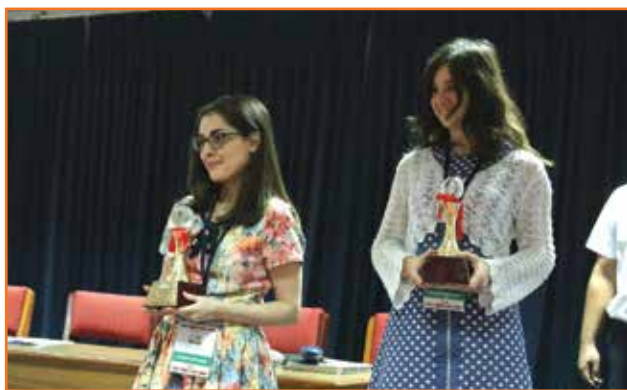
Students from RANEPa University, Moscow won the Entrepreneurship Game

Day 2 of the 8 th BRICS Conference began with a debate. The topic chosen for the war of words was, “Jobless Growth is the Ultimate Destiny of all Economies”. Speakers were called on stage to express their views for and against the same.