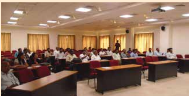
Participants at conference at GST

The purpose of this half-day conference is to provide a forum for professionals in the area of finance, commercial, logistics and related functions from the industry to exchange views and ideas on the GST bill, with the experts who will deliberate on the following themes: