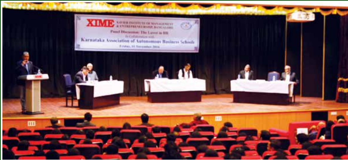
Inauguration of HR Panel Discussion