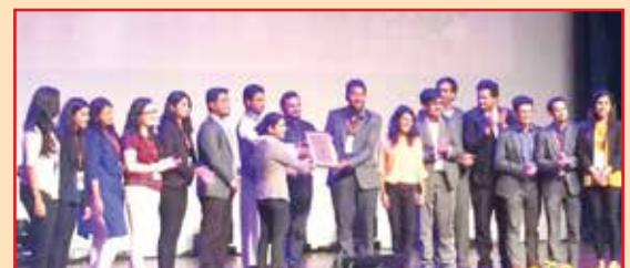
XIMEans receiving overall championship at USHUS 2016

XIME won for the 4 th time in Christ University Management Fest