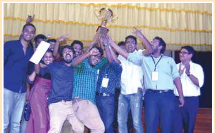
Winners of Championship at Rajagiri Centre for Business Studies